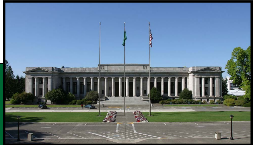
Temple of Justice